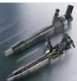
共轨喷油器 Common Rail Injector

The Technical Center Diesel with its competence-specific departments was founded in order to enhance the local Research and Development capability of our products and the needs of our customers in China.