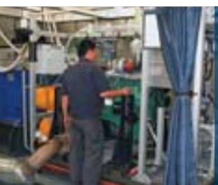
柴油发动机标定 Engine Calibration

Our Technical Center also offers training to the associates of our customers. The role based training with its job oriented training modules provides the knowledge and the skills for different target groups. The training is conducted by our engineers with first-hand project experience. By providing this training we are able to ensure a better technical understanding which translates to smooth running projects.