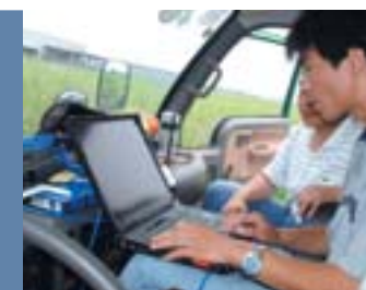
车上培训/练习 Training in Vehicle