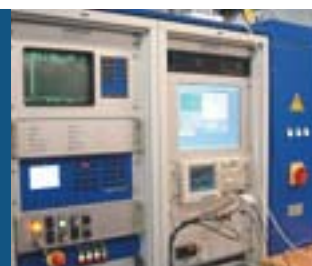
系统开发部 System Development