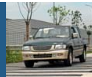
RBCD试车跑道， 车辆测试 Vehicle Testing on RBCD Test Track