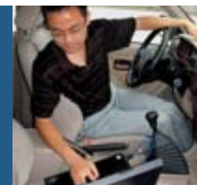
车辆标定 Vehicle Calibration