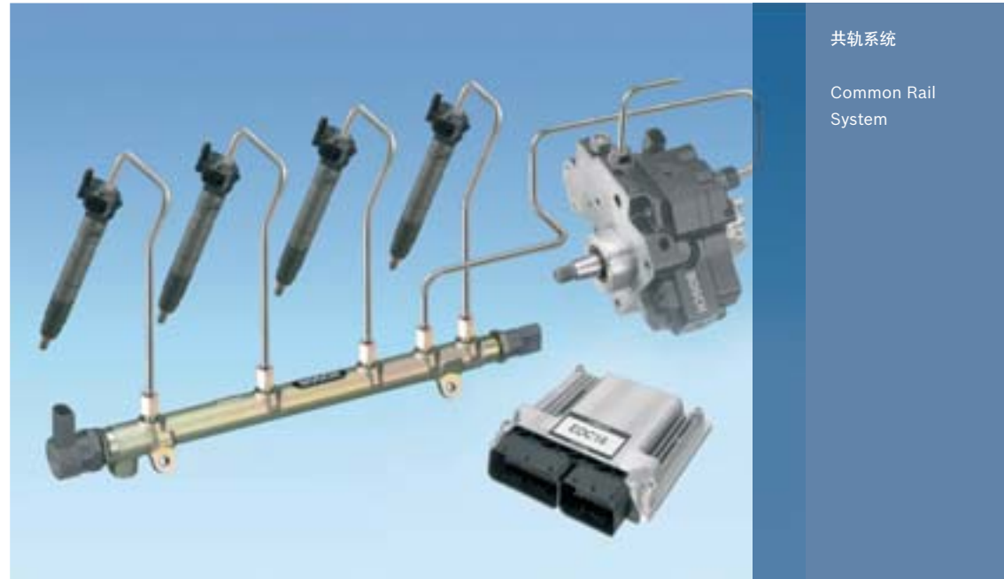
共轨系统 Common Rail System