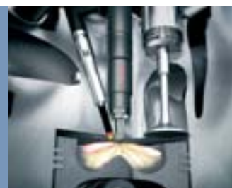
高压喷射 High Pressure Injection