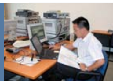
模拟试验平台培训 Training on Lab Cars