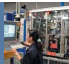
共轨测试台架 Common Rail Test Bench