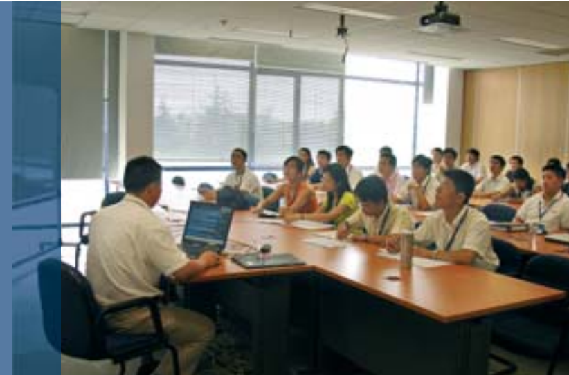
技术培训中心，专家授课 Engineering Training Program. Training lecture with our experts